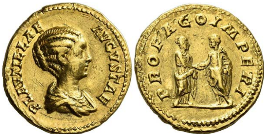
Plautilla, wife of Caracalla. Gold Aureus 202-205, 7.01 g. RIC 36. NAC Auction 150, 2 December 2024, Lot 885, realized 8,000 Swiss francs (US $9,080)

Strapped for cash to pay his troops, in 215 Caracalla introduced a coin that led to disastrous inflation for the rest of the century. The antoninianus officially valued at two denarii, contained silver worth only about one and a half. The emperor's spiky radiate crown became the standard mark of denomination. By collecting taxes in denarii and making payments in antoniniani the treasury raked off a profit. The antoninianus eventually declined to a bronze coin with a trace of silver on the surface.