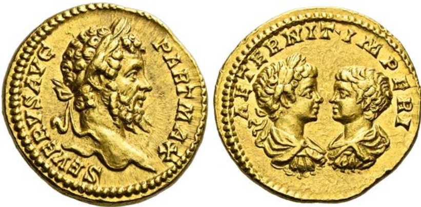
Septimius Severus, 193 – 211. Gold Aureus circa 200, 7.26 g. SEVERVS AVG – PART MAX Laureate head of Septimius Severus r. Rev. AETERNIT IMPERI

In the year 193 CE, Septimius Severus was the last man standing in a civil war that saw five rival warlords attempt to seize the imperial throne. On coins, Severus often depicted his family members, including his highly educated and capable Syrian wife, Julia Domna, and his young sons, Caracalla and Geta, who hated each other from early childhood. On the reverse of a rare gold aureus issued about the year 200 the two boys face one another, with the hopeful inscription AETERNIT•IMPERI "eternity of the Empire."