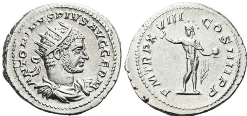
Caracalla augustus, 198 – 217. Antoninianus 215, 4.89 g. RIC 264. NAC Spring Sale, 10 May 2021, Lot 1396, realized 110 Swiss francs (US $122)

Strapped for cash to pay his troops, in 215 Caracalla introduced a coin that led to disastrous inflation for the rest of the century. The antoninianus officially valued at two denarii, contained silver worth only about one and a half. The emperor's spiky radiate crown became the standard mark of denomination. By collecting taxes in denarii and making payments in antoniniani the treasury raked off a profit. The antoninianus eventually declined to a bronze coin with a trace of silver on the surface.