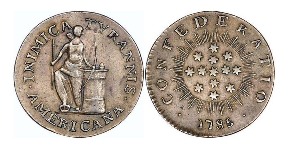
19<sup>th</sup> Century Die Struck Copy - "1785" (i.e. 1863) Large Star Confederatio Cent. Bolen Struck copy. Musante JAB-7, Kenney 2, W-14230. Rarity-6. This was worn to look circulated.