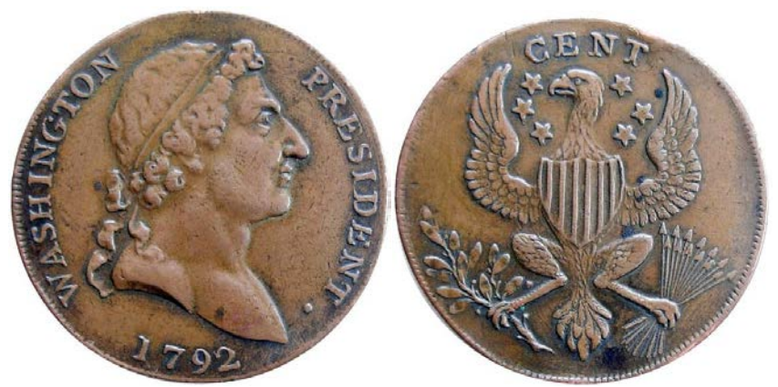
19<sup>th</sup> Century Electrotype - 1792 Washington Roman Head Cent. Musante GW-21, Baker-19, W-1084. Rarity-6 as an electrotype.