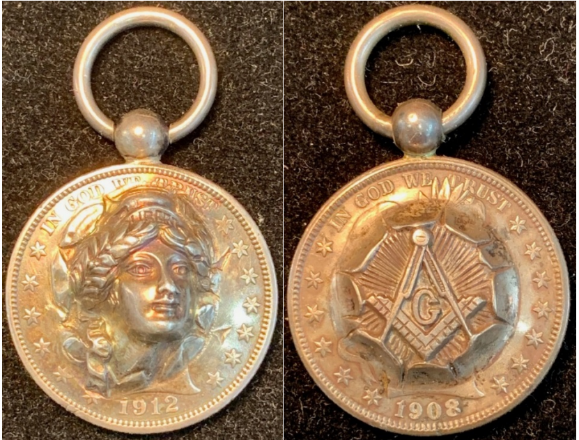
Watch Fobs - Goddess of Liberty Emergent on 1912 Half Dollar and Freemason "Square and Compasses" with "G" on 1908 Half Dollar

workshop, founded in 1900 by six women graduates of the Art Institute of Chicago, and known for hand-wrought metalwork, silversmithing, and copper working. They made silverware, hollowware and jewelry intended to be beautiful, useful, and enduring. They opened a New York shop on Fifth Avenue in 1912, that only lasted until World War I when skilled metalworkers were conscripted to work in naval shipyards.