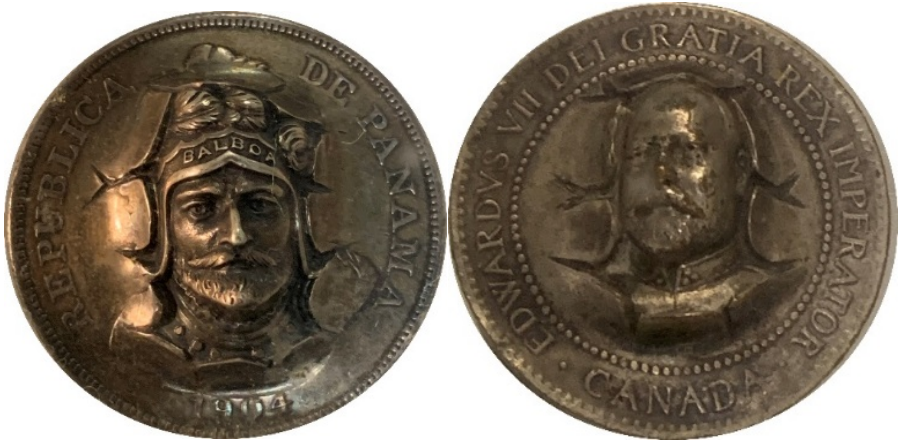
Handsome Early Pop-Outs on Foreign Coin Hosts: Vasco Nuñez de Balboa on Panamanian Host and King Edward VII on Canadian Host

Original pop-outs were hosted on high-grade Indian head cents, Barber dimes/quarters/half dollars, Morgan silver dollars, and a few are known on gold coins as well as on foreign coins of Canada, France, and Panama from 1903-1904. Very few pop-outs were hosted on nickels (due to hardness).