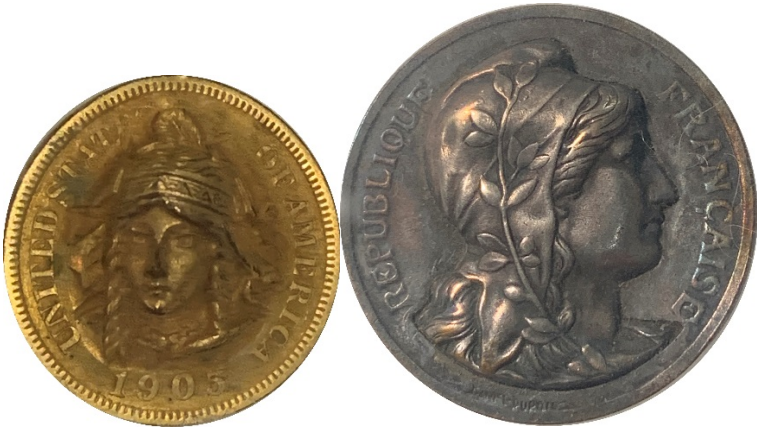
Native American pops on 1905 Cent beside French “Marianne”

The VNA thanks Mark Switzer for letting us peek at many of the finest and rarest examples of classic and contemporary Pop-Out art.