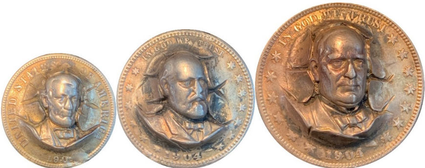
Martyred Presidents Abraham Lincoln / James Garfield / William McKinley on 1904 Host Dime / Quarter / Half Dollar

Classic pop-outs required a multi-piece set of anvil, collar, and hammer dies, and took as many as twenty steps to produce. The Malliet Process required the flat head on the face of the coin to be cut out and the new 3-D head to be rendered pliable and shaped into a pre-determined form. It was then soldered, brazed, or welded back onto the original disk (coin) which had been rendered convex, then scored, chased, or cut to give the appearance of a jagged opening through which the head emerges. The entire product would be oxidized, burnished, or ornamented with gilding or enameling to set off a contrast between the coin disk and the form of the head. The button or medallion would then be worked into various articles of jewelry using applied loops, chains, hat pins, or watch clips.