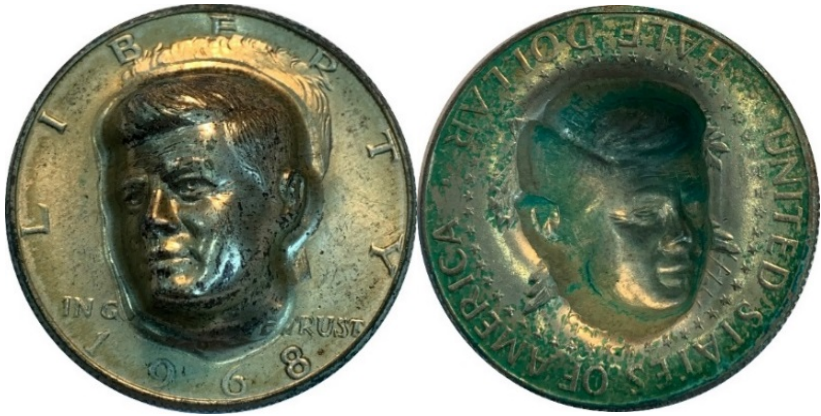
Pop-Out for John Kennedy on 1968 Half Dollar - These modern Pop-outs lack the fine workmanship of classic Pop-Outs

Classic pop-outs required a multi-piece set of anvil, collar, and hammer dies, and took as many as twenty steps to produce. The Malliet Process required the flat head on the face of the coin to be cut out and the new 3-D head to be rendered pliable and shaped into a pre-determined form. It was then soldered, brazed, or welded back onto the original disk (coin) which had been rendered convex, then scored, chased, or cut to give the appearance of a jagged opening through which the head emerges. The entire product would be oxidized, burnished, or ornamented with gilding or enameling to set off a contrast between the coin disk and the form of the head. The button or medallion would then be worked into various articles of jewelry using applied loops, chains, hat pins, or watch clips.