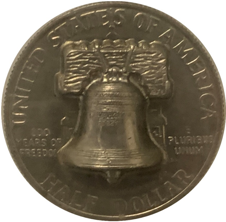
The Liberty Bell pops out of the reverse of a Bicentennial Half Dollar