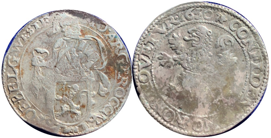
1650 Netherlands, Silver Lion Dollar (Leeuwendaalder) from the Island Province of West Friesland (“WESTF” in legend)

Counterfeit Lion Dollars appeared in the early 1700s as the mechanic arts of counterfeiting improved in America. Early, cast copies and later, silver-plate over copper counterfeits would pass in sketchy foreign trade outposts, in reasonable imitation of the original crude strikes. Recent, high grade counterfeits are also known, made to fool modern collectors. In 2017, the Royal Dutch Mint issued a proof Lion Dollar of Utrecht design in 0.999 fine silver as a one-ounce bullion round. In 2018 they issued the Zeeland Lion Dollar design, and in 2019 they issued the Gelderland Lion Dollar design as silver rounds. Lion Dollars and Half Lion Dollars are now recognized as “type coins” in The Official Redbook “A GuideBook of United States Coins - Mega-Red” 5th Edition, by R.S. Yeoman as World Coinage used in Colonial America. Lion dollars are the forgotten first dollars of early America.