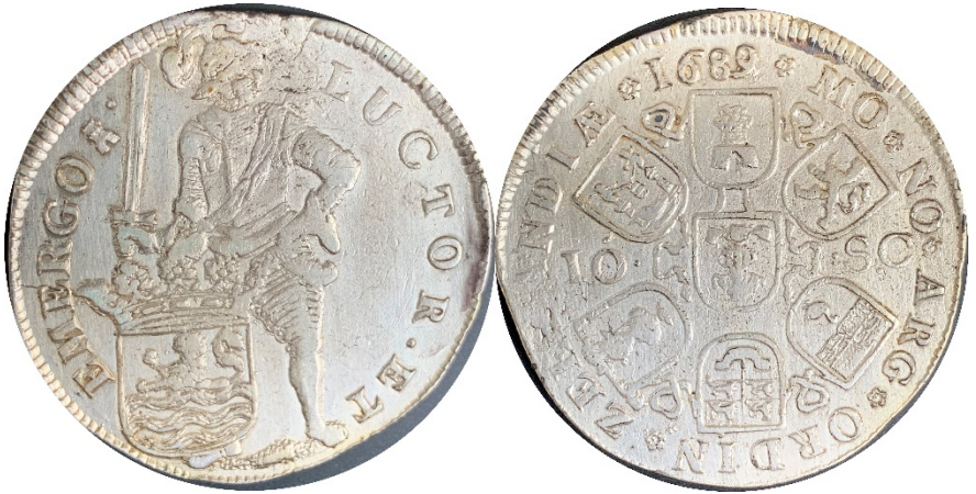
1689/8 Netherlands, Zeeland, silver 10 Schellings or Double Daalder of 60 Stuivers. Reverse: LUCTOR ET EMERGO, “I struggle but I emerge” the Motto of Zeeland (Rising out of the sea). Obverse: MO NO ARG ORDEN ZEELANDIAE.

The value of trade coins float with the price of precious metal across the globe and may not align well, with “units of account” as was the case with the Lion Dollar. One Leeuwendaalder, first authorized in 1575 to have 427 grains of 0.750 fine silver was valued at 32 (old) Stuivers, growing to 42 (new) Stuivers at the end of the Golden Age. Yet, Leeuwendaalders were reckoned worth two and a half Gulden (48 stuivers) by Dutch merchants in overseas accounts, so that Dutch merchants would rather pay foreign debt counted in Gulden but paid in “debased” Leeuwendaalders, rather than the more costly Rijksdaalders (“National dollars” for use in the Baltic trade) having 0.885 fine silver and which were more steadily valued from 48 to 50 Stuivers. Both Leeuwendaalders and Rijksdaalders appear to be made of good silver and are of comparable size and thickness.