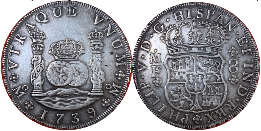
1739 Spanish Colonial Milled Piece-of-Eight from Mexico City

organize a government, the Continental Congress recognized the need for our own hard currency. Under colonial rule, England banned the export of British gold and silver coins, preferring to give their colonies ‘credit,’ which severely limited the amount of English coin supplied to the British colonies. Coinage was always in short supply in Colonial America. As a result, and out of need, some colonies issued paper currency and some defied England and had their own coins produced, but that is a subject unto itself. Both under British rule, and immediately following our revolution, money of choice in Virginia was whatever foreign silver could be obtained with the best being Spanish Colonial milled silver dollars of eight reales , and smaller fractional coins of 4, 2, 1, and \frac{1}{2} reales , because of their trusted quality and weight. In fact, the large eight reales was the forerunner of the American silver dollar. Many of us older folks have heard the old quip, “two-bits, four-bits, six-bits, a dollar.” That saying comes from the fact that one eighth of an eight reales coin was considered a “bit” (worth twelve and a half cents) thus eight bits equaled a dollar. Thomas Jefferson even adopted the Spanish Colonial piece-of-eight as a standard model for America’s new dollar currency.