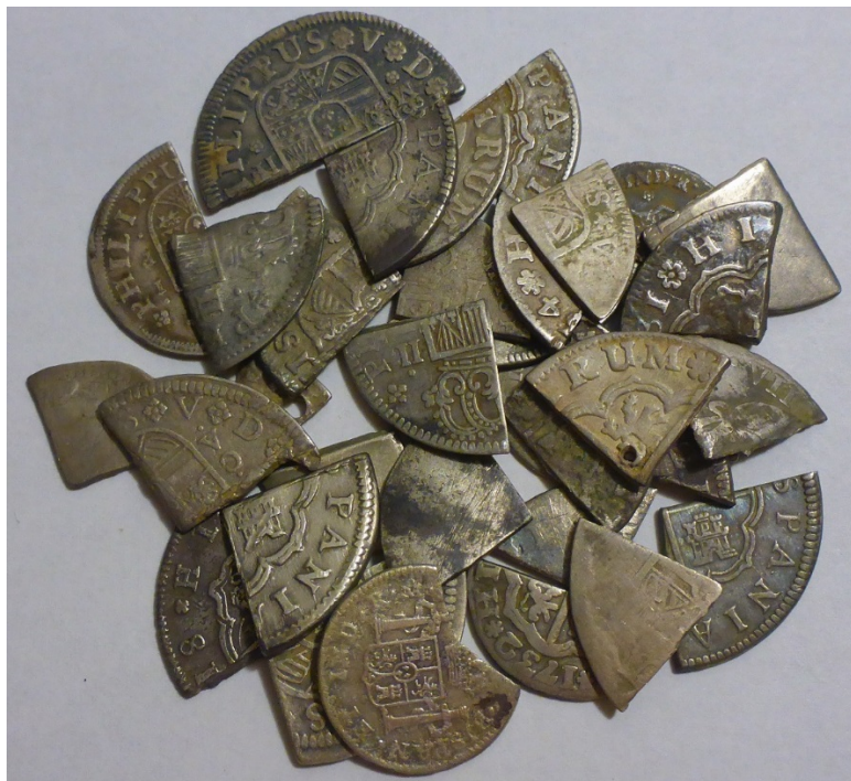
Spanish silver Pistareens, half Pistareens, and “Picayunes” commonly circulated in Virginia during the 18 th Century, often being cut to make exact small change

Pistareens generally disappeared from circulation in the early 1800s, replaced by Spanish Colonial reales , which are consistently found with the help of metal detectors in civil war camps and around period home sites, along with a variety of the other types of early U.S. coinage used prior to, and during the Civil War. Many are found with a small hole in them, thought to allow a soldier or traveler to sew the coins together into clothes as an effort to prevent accidentally losing them.