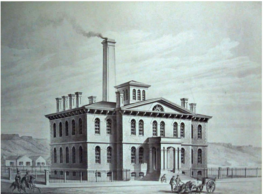
Carson City Mint

Congress authorized a new branch mint out West in 1863, to serve the largest silver strike in North American history, the Comstock Lode discovered in 1859. They sought to alleviate the need to transport tons of precious metal ore with no direct route from the Lake Tahoe region, across 172 statute miles, past 7000 feet tall Rocky Mountain peaks, through bandit territory, all the way to the Pacific coast for processing at the San Francisco Mint. Groundbreaking ceremonies at Carson City took place in September 1866, just eight years after the town was founded, five years after the formation of the Nevada Territory, and two years after Nevada statehood. A six-ton, Morgan & Orr steam-powered coin press (Coin Press #1) from Philadelphia arrived at Carson City in 1868. The construction of a Renaissance-revival sandstone mint building was completed in December 1869. The Carson City Mint opened for business under President Ulysses Grant in January 1870, and struck its first coin, a Seated Liberty Dollar with the new “CC” mint mark in February 1870. The Virginia & Truckee Railroad connected Carson City with the Transcontinental railroad at Reno in 1872 and by 1874, thirty-six trains a day were passing through Carson City during the peak production of the Comstock Mines.