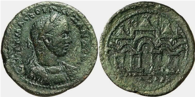
City of Anazarbus (modern Anavarza Turkey) in Cilicia under Severus Alexander circa AD 222-235

This coin is 31 mm and shows the acropolis of Philippopolis on the summit of a tree covered hill. There is another temple on the left at the base and it is thought the arches on the right edge represent an aqueduct. Caracalla is shown as a warlike emperor with spear and shield. Author's collection