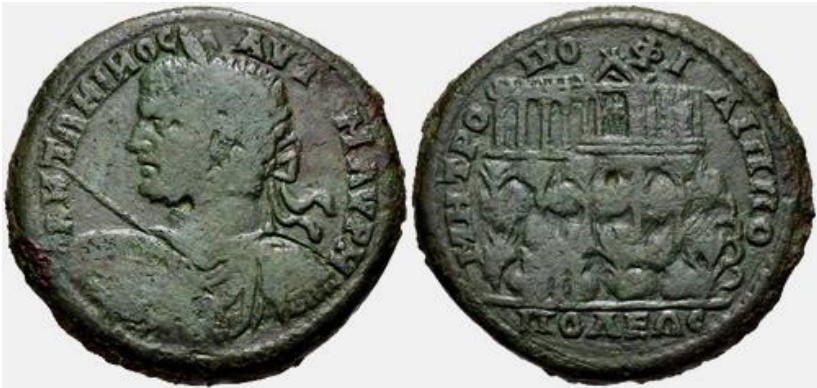
Coin of Philippopolis in Thrace (modern Plovdiv, Bulgaria) under Caracalla circa AD 198-217

This coin is 31 mm and shows the acropolis of Philippopolis on the summit of a tree covered hill. There is another temple on the left at the base and it is thought the arches on the right edge represent an aqueduct. Caracalla is shown as a warlike emperor with spear and shield. Author's collection