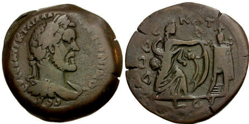
Alexandria, Egypt drachm of the emperor Antoninus Pius dated to AD 148/149 by regnal year

The beginning of provincial coinage is generally dated to the Imperial period following the death of Julius Caesar, though it is rare and sporadic up until the time of Augustus as emperor and the annexation of Egypt. There are a few coins of earlier origin that could be argued into the definition, but they are few and far between. The last issues were late in the third century. There have been many books written about this topic so at this point it may be best to just show some examples of the coins.