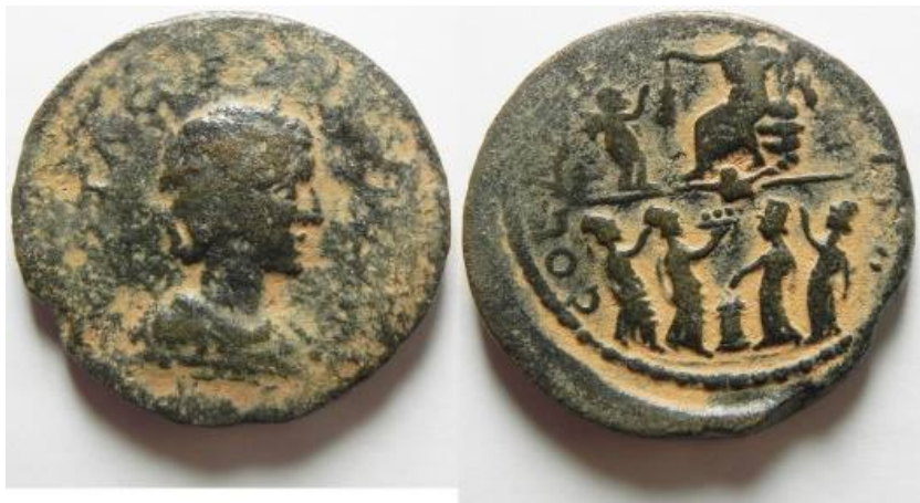
Coin of Damascus in Syria under Philip I struck for his wife Otacilia Severa circa AD 244-249

This 28 mm coin has a lot going on in terms of action and iconography. Above the center line Tyche-Astarte is seated on a throne holding an object (probably a rudder) while Marsyas looks on. The river god Chryssorhoas is swimming at her feet. Below are four lesser tyches worshipping – the two outer ones raise their hands in praise, the left inner holds up a platter of what looks like fruit and the inner right is lighting an altar. Author's collection.