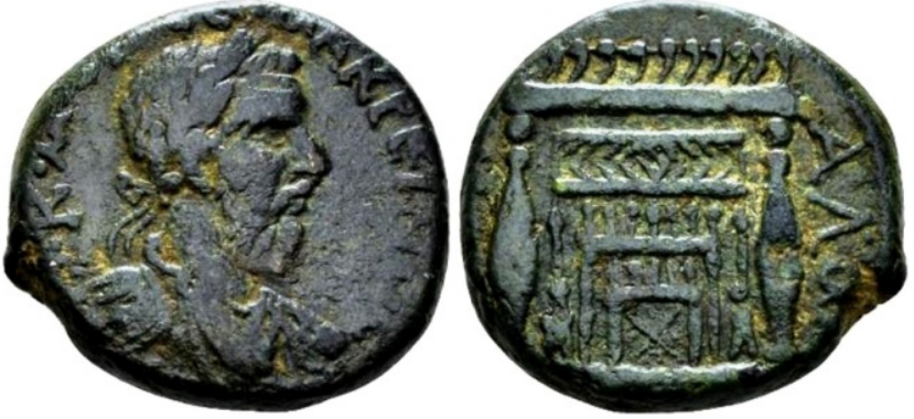
Coin of Ascalon (modern Ashkelon Israel) in Judaea under Macrinus circa AD 217-218

supply of the city – probably what is known as a Nymphaeum which were by this time large public fountains and were the source of much civic pride. These buildings were often featured on coinage. In this case it has also been suggested that it shows a large agora complex or gymnasium in the background. In any case it must have been a spectacular place in ancient times, sometimes I try to picture it under a full moon lit inside by hundreds of lamps. Author's collection.