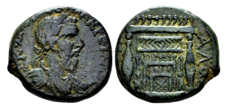
Coin of Ascalon (modern Ashkelon Israel) in Judaea under Macrinus circa AD 217-218

supply of the city – probably what is known as a Nymphaeum which were by this time large public fountains and were the source of much civic pride. These buildings were often featured on coinage. In this case it has also been suggested that it shows a large agora complex or gymnasium in the background. In any case it must have been a spectacular place in ancient times, sometimes I try to picture it under a full moon lit inside by hundreds of lamps.