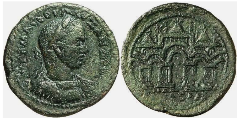
City of Anazarbus (modern Anavarza Turkey) in Cilicia under Severus Alexander circa AD 222-235

This coin is 31 mm and shows the acropolis of Philippopolis on the summit of a tree covered hill. There is another temple on the left at the base and it is thought the arches on the right edge represent an aqueduct. Caracalla is shown as a warlike emperor with spear and shield. Author's collection