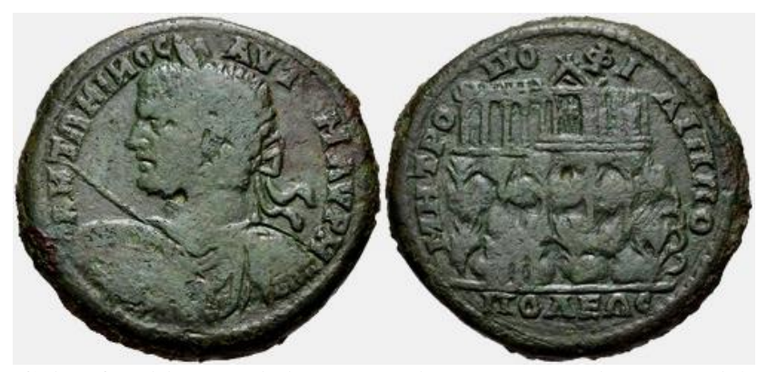
Coin of Philippopolis in Thrace (modern Plovdiv, Bulgaria) under Caracalla circa AD 198-217

This coin is 31 mm and shows the acropolis of Philippopolis on the summit of a tree covered hill. There is another temple on the left at the base and it is thought the arches on the right edge represent an aqueduct. Caracalla is shown as a warlike emperor with spear and shield. Author's collection