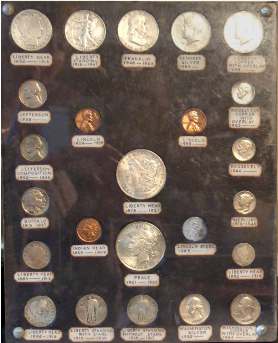
24-Slot, Plexiglass, 20 th Century Type Set (assembled circa 1965)

Reverses of these type set coins are seen when the back of the holder is held upside-down (given a “coin turn”). The coating on the reverse of the 1943 steel cent has disintegrated indicating this type set has been together, undisturbed in this frame for a very long time. It seems likely this set was assembled from coins found in circulation fifty-seven years ago as silver began to be pulled out from circulation. Thanks to Molly and Chris Landgraf for sharing images of this great type set.