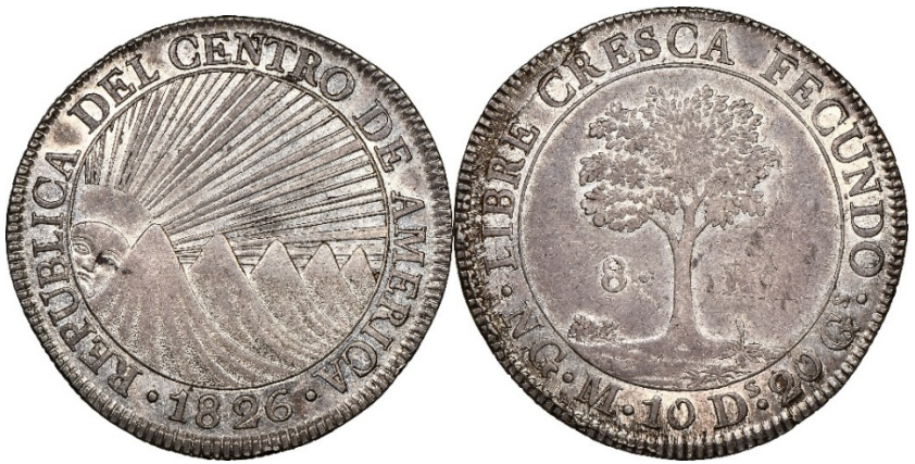
1826 Eight Reales of the Central American Republic (New Guatemala Mint)

which the Spanish Americas feared a French invasion. Many of these regions raised and followed military Juntas to oppose anticipated French invaders. These Juntas included “Revolutionaries” and “Loyalists.” “Revolutionaries” sought independence from Spanish rule, inspired by the American Revolution, and French Revolution while “Loyalists” remained loyal to Spanish King Ferdinand VII; yet both sides united under the threat of Napoleon, marching under the banner of self-interest in protecting their home from imperialistic designs on the part of the French Empire. Ferdinand VII became a captive to France by the end of 1810. Spanish “Revolutionaries,” and governing, Spanish American Juntas grew to expect and soon demand a “popular sovereignty” doctrine. With the defeat of Napoleon in 1814, Ferdinand VII returned to power and re-imposed “absolutism.” Spanish King Ferdinand VII abolished the powers of the local Criollos , or Spanish descendants who had governed the Spanish Americas for centuries, and replaced them with Spanish-born appointees, collapsing support for the Spanish King in the Americas. Over the next decade “Revolutionary” armies throughout the Spanish Americas fought to win their independence.