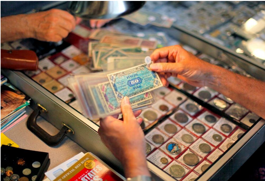
Image from 2017 Norfolk Coin Show

photos, videos, reviews, posts, upcoming shows, events, memorials, cartoons, displays, community, and numismatic links at: https://www.facebook.com/VirginiaNumismaticAssociation/