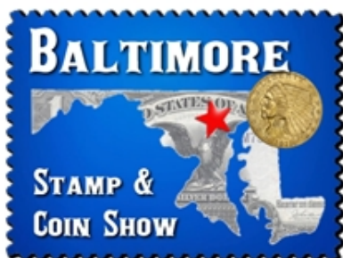
PHOTO I.D. AND REGISTRATIONS AT SHOW REQUIRED

FREE ADMISSION AND PARKING HANDICAP ACCESSIBLE SECURITY