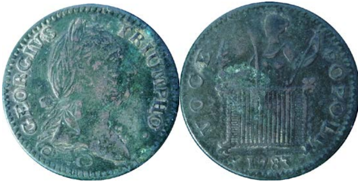
Georgious Triumptho imitation copper, dated 1783, but likely made circa 1790, shows an Irish-style portrait of "George" wearing laurel wreath with mysterious allegorical figure on the reverse ascribed as "Liberty" in a balloon basket ready to ascend to the heavens (a popular pastime in Paris in 1783), buoyed by the "voice of the people," or perhaps "Britannia" in a barrister's box hemmed in by thirteen bars (colonies) with French Fleur-de-lis finials, on trial for losing America.

During Washington's lifetime tokens dishonoring King George III's loss of the American Colonies at the Treaty of Paris in 1783 may be attributed to the other "George" (Washington).