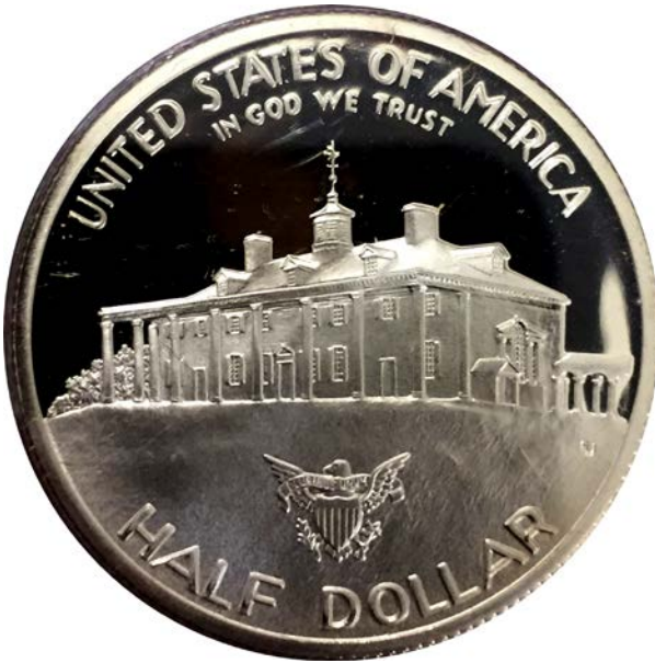
1982 Silver Proof, George Washington Commemorative Half Dollar, San Francisco Mint, issued at the 250th Anniversary of his birth