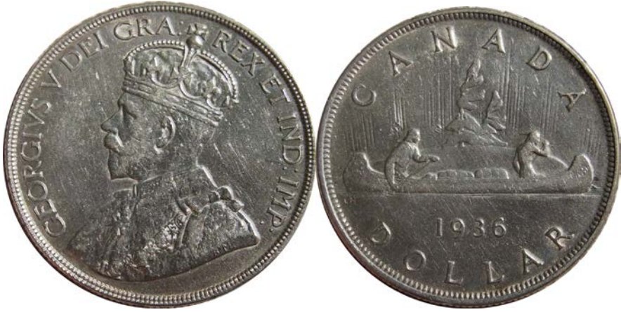
George V, 1936 Silver Dollar with Voyageurs reverse

some other direction for a while, well, let's cast our gaze up north, to another set of silver dollars.