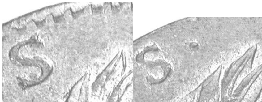
Left image shows the “no-point” obverse - The right image shows a “with point” obverse

However, if one wants to collect Virginia halfpence by variety, a good starting point is to obtain one of each of the major varieties. Obverses are divided into two groups – those with a point or dot following GEORGIVS in the legend and those without.