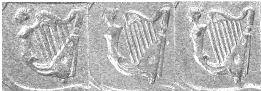
Images above show harp on left with 6 harp strings, middle with 7 harp strings (most common) and right with 8 harp strings.

Reverses are divided into three groups based on the number of harp strings – six, seven, or eight strings.