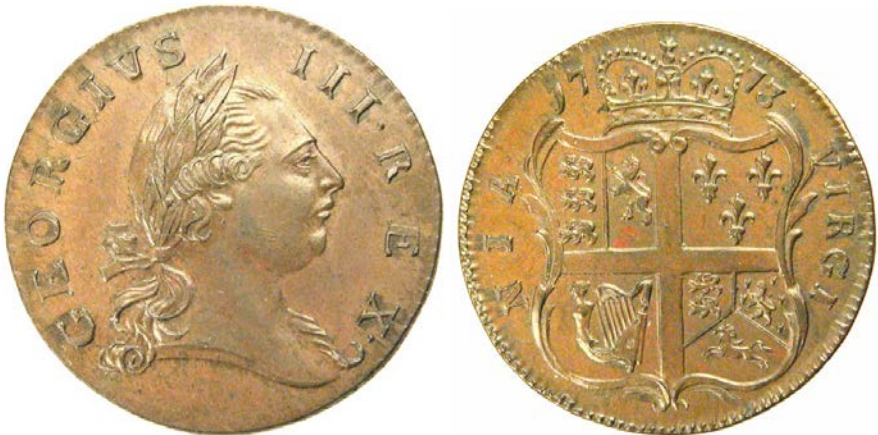
1773 Virginia Halfpenny - Seven Harp Strings - No Dot after "Georgivs" Variety Newman 7-D

Having established that a Virginia halfpenny should hold a special place in a every coin collection, the choice of which coin to add remains open. At this time there are 30 known varieties of Virginia halfpence but one of the great difficulties that has existed and has served as a blockade in collecting Virginia halfpence by variety is the small and difficult to discern differences between each variety. In addition, the available references for identification of varieties have images that are difficult to see and include a number of errors. The identification problem will be remedied in the near future, by publication of a book on Virginia halfpence, emphasizing attribution and variety identification.