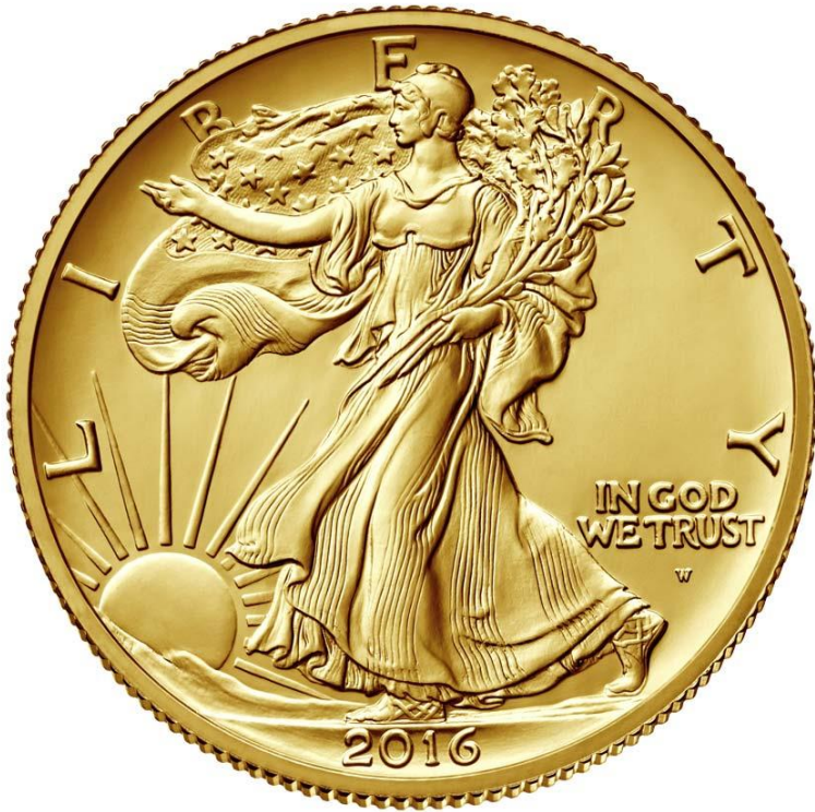
2016 Walking Liberty Centennial Gold Coin from West Point Mint