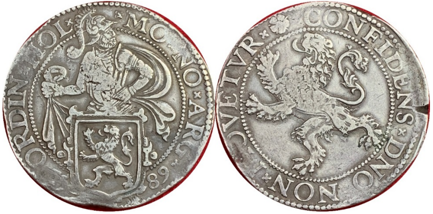
1589 Dog Dollar [of Holland]

isn't a dog at all, it's just another one of those stupid lions, but once I'd gotten into the subject there was no turning back.