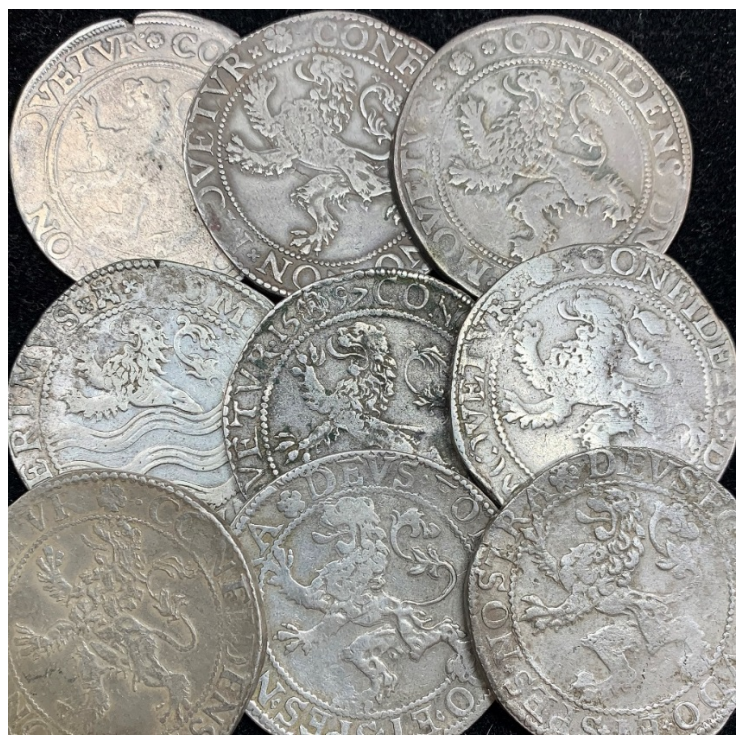
Is this a "pride of lions" or a "pack of dogs?"