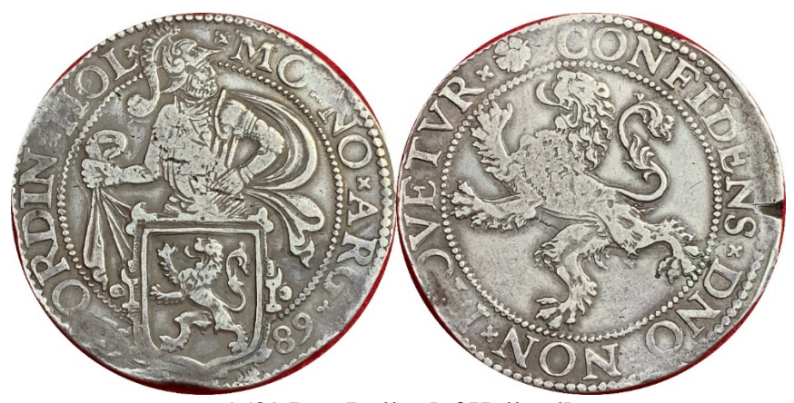
1589 Dog Dollar [of Holland]

isn't a dog at all, it's just another one of those stupid lions, but once I'd gotten into the subject there was no turning back.