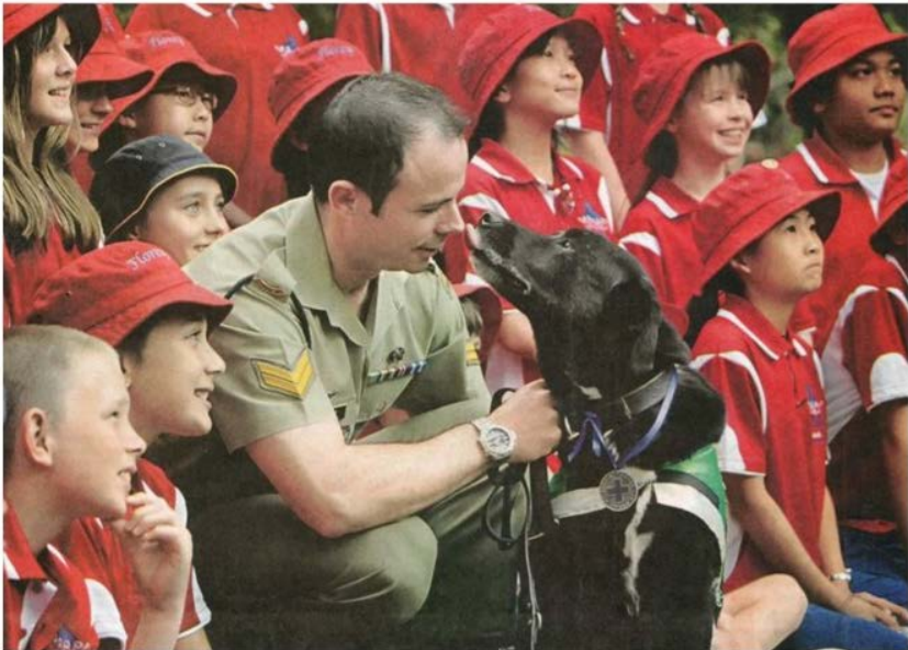
Brave Service Dog wears "Purple Cross"