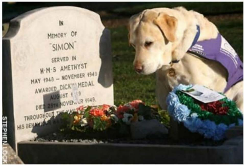
Service Dog honors grave of Simon, Ship's Cat of the HMS Amethyst.