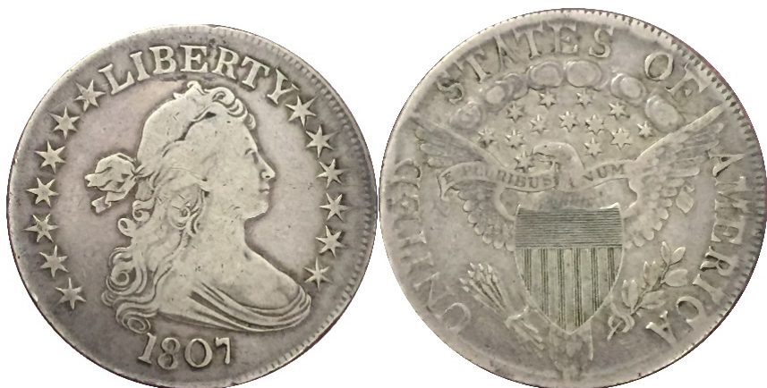
1807 Half Dollar with LIBERTY and E PLURIBUS UNUM Mottos

“LIBERTY” was and still is used on most, (but not all) regular issue United States coins. Liberty may be hidden on hair ribbons, only to disappear after moderate wear. Many U.S. coins have only this one-word motto to suffice, including all copper half cents and large cents as well as the initial “Small Eagle reverse” design used on early silver and gold coins, starting in 1794. One-word motto “Liberty” coins resumed with Seated Liberty half dimes starting in 1837, Seated Liberty and Barber Dimes from 1837 to 1916, all 20-Cent Pieces, Bust and Seated Liberty Quarters from 1831 to 1866, Bust and Seated Liberty Half Dollars and Dollars from 1836 – 1866, all Gold Dollars, Quarter Eagles from 1834 to 1907, all three-dollar gold, Half Eagles from 1834 to 1866, Eagles from 1838 – 1866, and Double Eagles from 1849 to 1866.