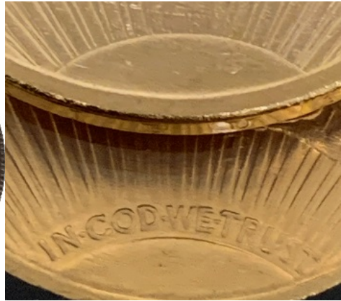
Left: 1864 Two Cent Piece (Large Motto on Ribbon) / Right: Saint-Gauden's Double Eagle Gold Design Without Motto (1907 – 1908) and With Motto added to orbit the surface of the sun below the sun's rays

“IN GOD WE TRUST” appears on U.S. coins since the Civil War but it was not adopted on U.S. currency until the Cold War in 1955, by President Eisenhower, to further distinguish ourselves from the Soviet Union which officially does not believe in any deity. This solemn saying seems most needed during times when uncertainty about the future runs high as it did in 1863 when it was first proposed (think of the high-water-mark of Gettysburg) and again when H-bomb testing by foreign powers decided a President, whose family roots came from a Gettysburg farm, that the motto must become universal on coins and currency, just in case, so that future antiquarians would know where we stood when the crises came.