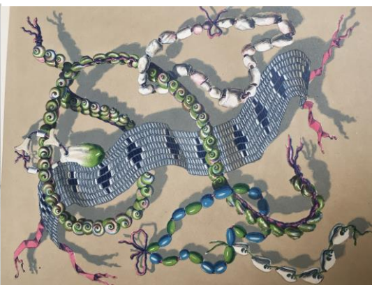
Plate V – Color Lithograph of Wampum