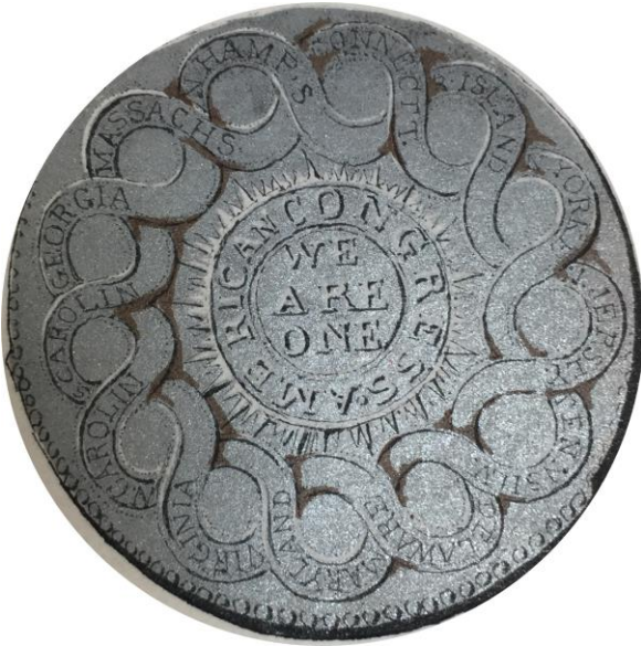
“Continental Currency” detail from “fac-simile” printed in The American Numismatological Manual (Plate VIII, Coin 7) by Montroville Dickeson, MD, Philadelphia, 1859.